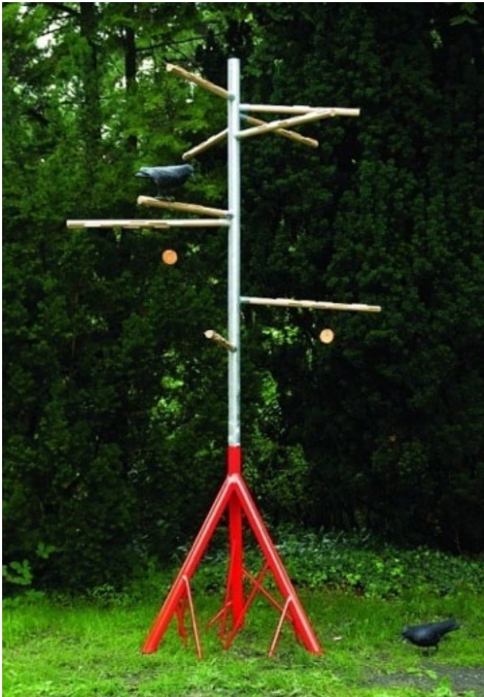
Service Crows, Haus am Waldsee

The urban habitat represents the artistic system, the designed environment. A construct that is tailored solely to human needs. But nature returns – more and more wild animals are finding their way into the urban habitat. However, city dwellers often consider them a nuisance or even a threat. The project came up with visionary ideas for sustainable coexistence with wild animals in the city for the future. Artistic interventions invited Berliners to reflect on this issue.