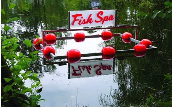
Fish Spa, Haus am Waldsee