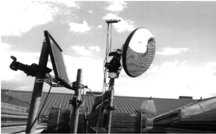
Sun reflector