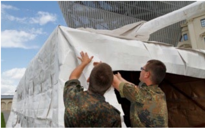
LEOrigamiPARD III, 2011/2012, Karton, gefaltet von Soldaten der Bundeswehr vor dem Militärgeschichtlichen Museum der Bundeswehr in Dresden / Copyright: Denis Bury