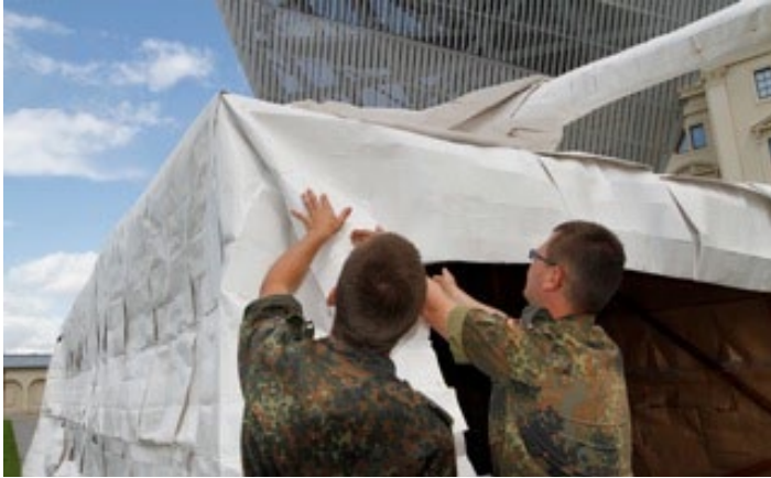
LEOrigamiPARD III, 2011/2012, Karton, gefaltet von Soldaten der Bundeswehr vor dem Militärgeschichtlichen Museum der Bundeswehr in Dresden