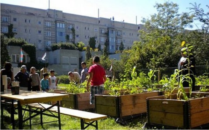
Community Garden Oranienstr. 54