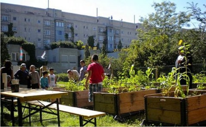
Community Garden Oranienstr. 54