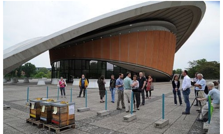
Bee hives at the HKW / Copyright: Joachim Loch

AUSTERTRAU established the Haus der Kulturen der Welt – also known in Berlin as the “pregnant oyster” – as a model case study that shows under what conditions sustainable art is possible. This communication and research project spanned utopian artistic concepts and ideas to scientifically founded observations all the way to practical implementation in the Haus and its environment. Dialogue and idea development with the staff of the HKW played a central role in identifying concrete approaches to art and sustainable living. During the Festival “Austerbank” – a shell-shaped infopoint – was installed.