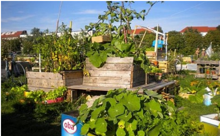
Allmende Kontor Tempelhofer Feld