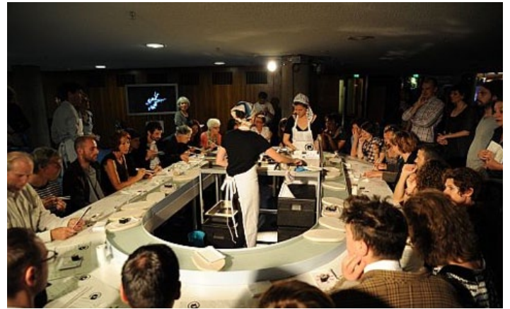
Restaurant Installation

The SOCIAL SEEDS project aims to create new agro-socio biotopes by planting old, rare and cultural plant species from the region in Berlin community gardens to allow social and biological diversity to develop over the long run. Particularly in the community gardens in the city, the idea is to pinpoint a diverse range of people with different geographic, cultural and artistic backgrounds who are passionate about gardening. Together with the community gardeners, individual "favourites" from among the different types of plants and seeds are to be cultivated and a network created to encourage people to share their experiences