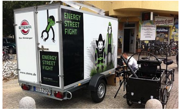
Solar-driven game station