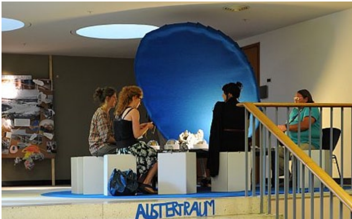
Austerbank