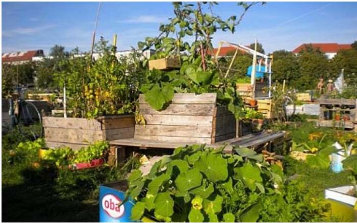
Allmende Kontor Tempelhofer Feld