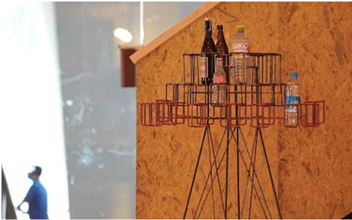
Prototype Collection Station for Returnable Bottles