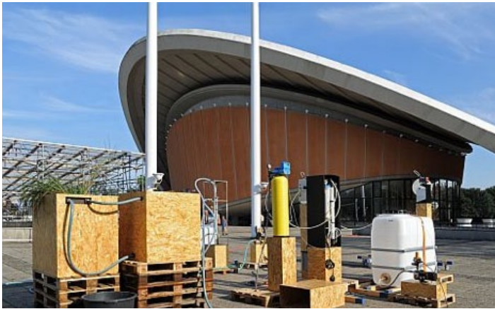
Modular drinking water system