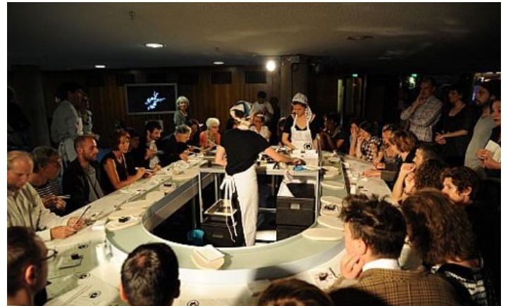
Restaurant Installation / Copyright: Joachim Loch